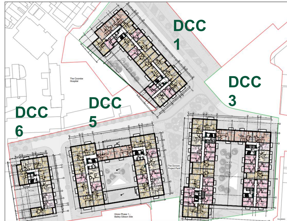
Donore Project – Ground Floor Layout Plan