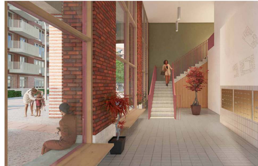
Block Entrance – Ground Floor Lobby