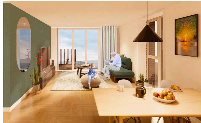
Living Space – Typical Home Layout