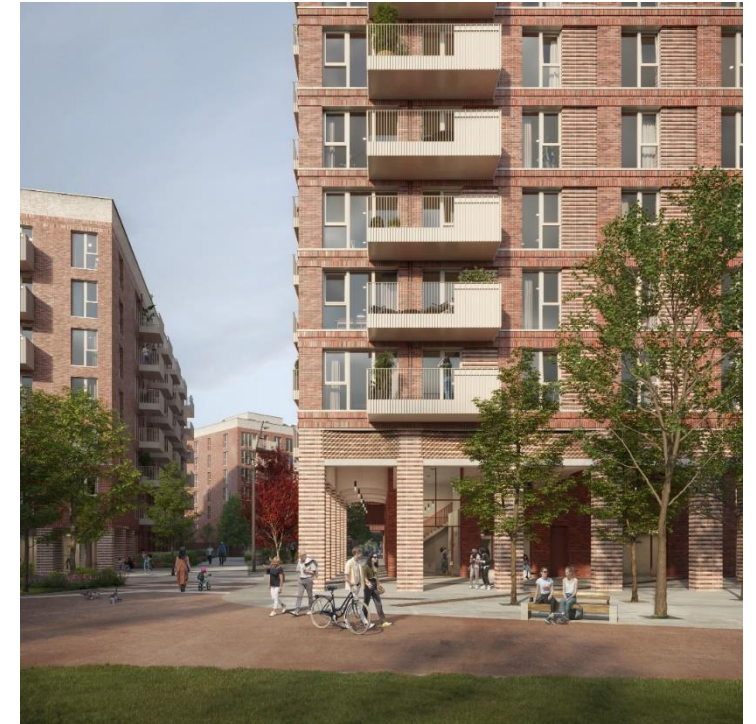
Block DCC3 – close up view from the South