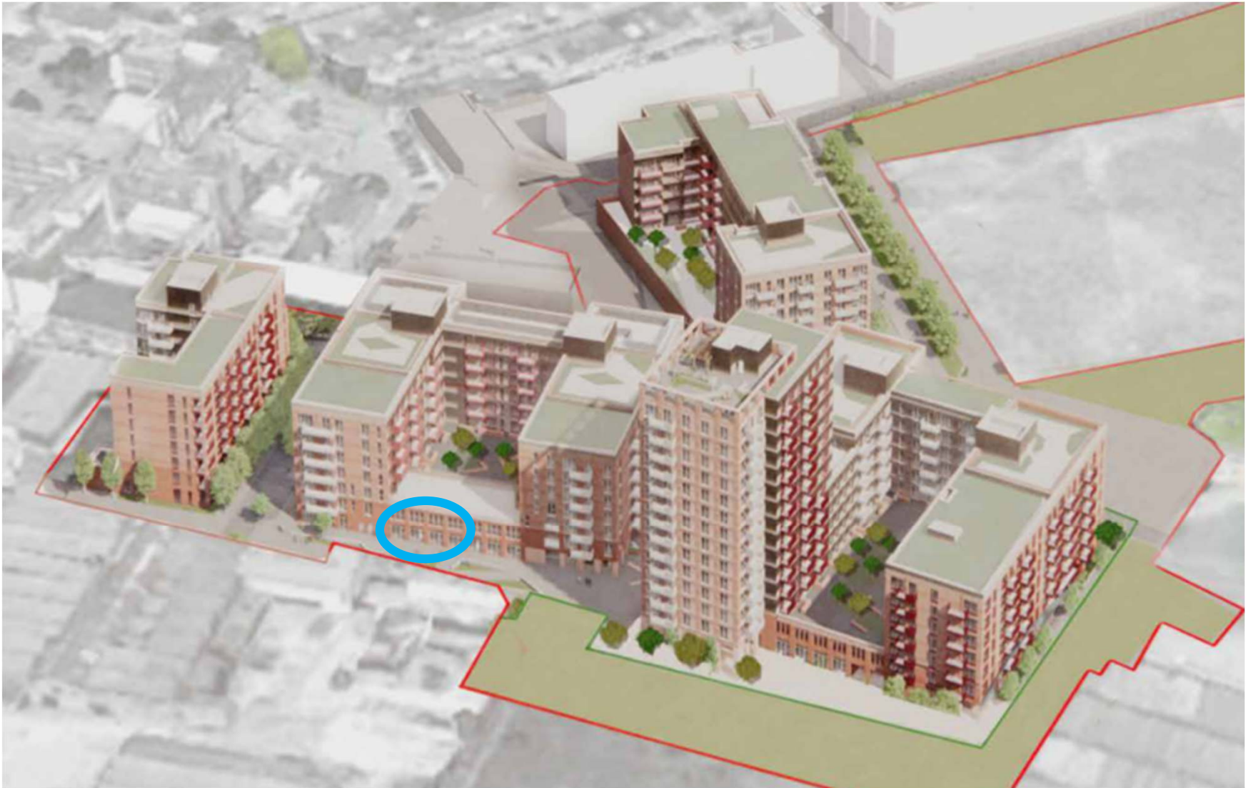
Block DCC5 – Proposed Location of Donore Boxing Club