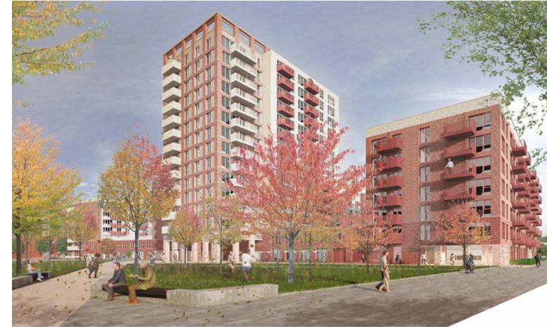
Block DCC3 – view from the Southeast