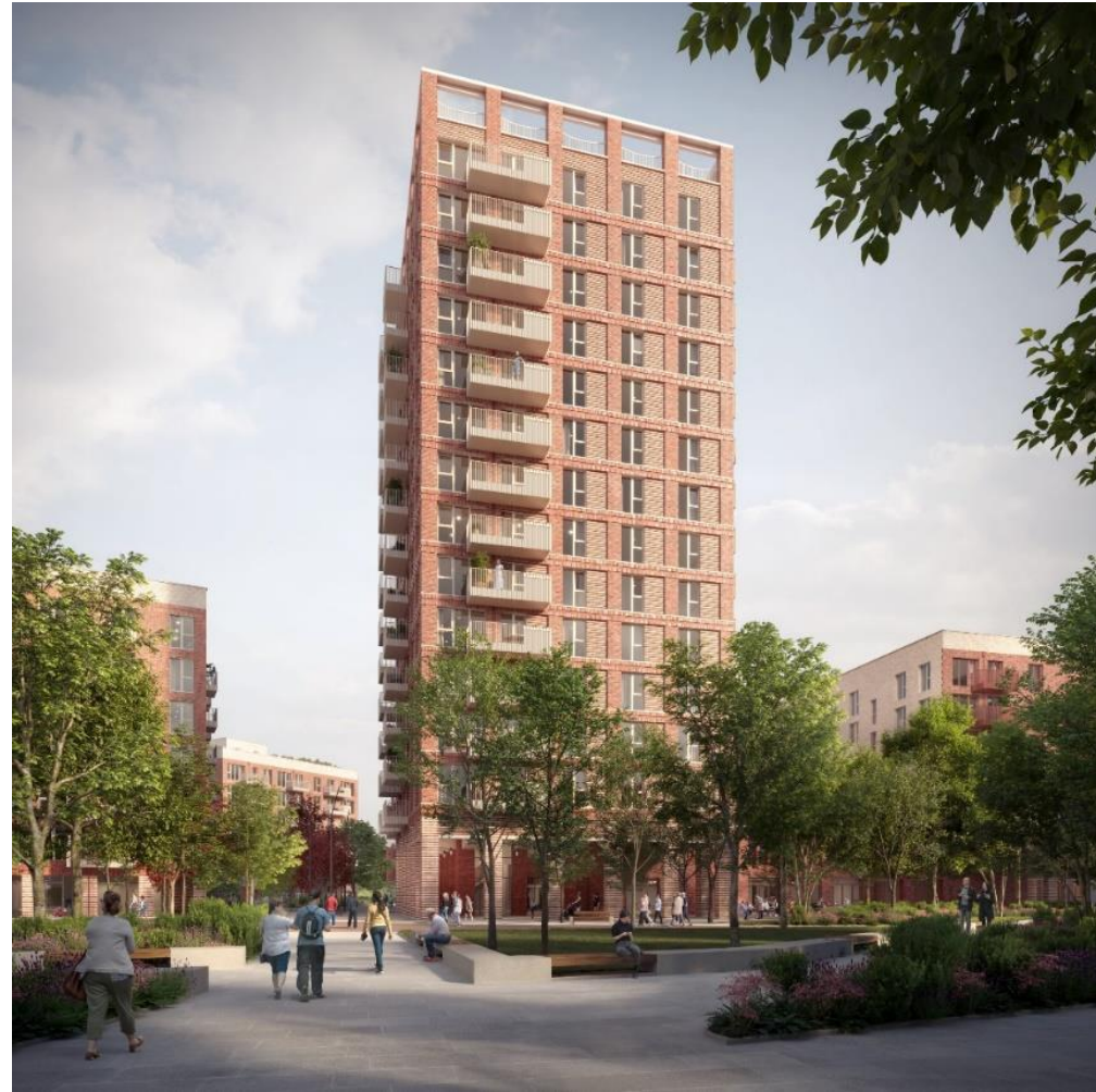
Block DCC3 – view from the South