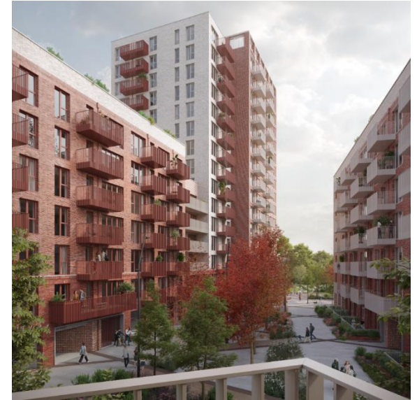
Donore Project Park – view towards Block DCC3