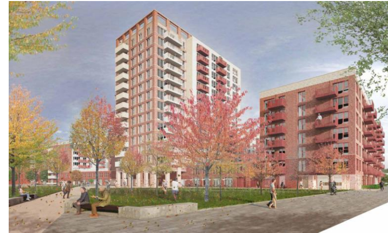
Block DCC3 – view from the Southeast